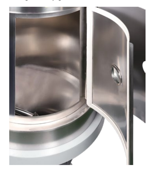
Cleaning door for drying bin

The integrated sCONVEY CHS loader is used to transport plastic granulate quickly and without contamination to the processing machine or the drying bin. Costly downtimes are avoided by precisely coordinated material conveying to the processing machine. This prevents material loss and the production area remains clean and safe. When conveying hygroscopic materials with small throughputs or where space is limited a sCONVEY CMS machine loader version with 0.5l is available. The discharge module of the loader has no discharge flap and the unit must be mounted directly on the feed throat of the processing machine.