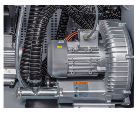
Side channel blower

All drying models are equipped with especially large cleaning doors with an inspection window and can be opened with the help of a quick-release lock. The doors are adapted to the shape of the drying bin which optimises the material flow and makes cleaning easier. A hinged lid facilitates the access from above.