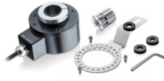
HS35P – Programmable square wave with cable