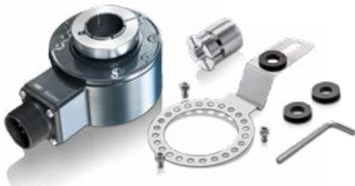
HS35P – Programmable square wave with MIL connector